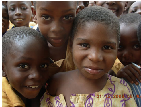
Children in Ghana served by Rotary West's water project.