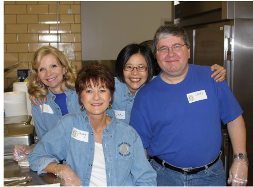
Great fellowship while fundraising at the annual pancake breakfast

Rotary clubs are non-religious, non-governmental and open to every race, culture and creed. Club membership represents a cross-section of local community business and professional leaders.