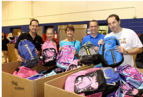
Back to School Backpacks, a local Cedar Rapids West service project.

Rotary clubs are non-religious, non-governmental and open to every race, culture and creed. Club membership represents a cross-section of local community business and professional leaders.